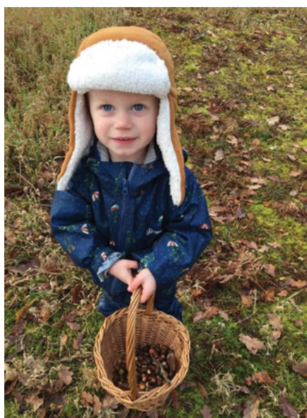
Collecting and sowing acorns.

THE LOVELY AUTUMN weather - dry and fairly sunny - meant that the water level in the old curling pond stayed very low and that seemed to encourage the growth of vegetation. So for a while there was a lot of mud and greenery but not so much water. This allowed us to get on our waders and dig out some of the silt that has accumulated over the last 5 or 6 years. (There is more to do, so if you think playing with that much mud looks like your kind of thing, come along to one of our first-Thurs-of-the-month afternoons). The water is once again flowing over the top of the sluice and the pond looks more attractive - although changing water levels and the appearance of some mud and vegetation form part of the normal cycle of pondlife and we try to manage this, not stop it happening.