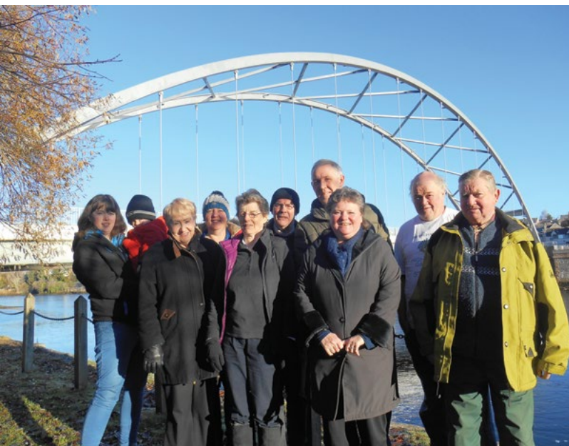
Some of the Invercharron committee.