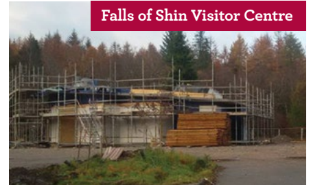
Falls of Shin Visitor Centre