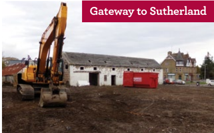
Gateway to Sutherland