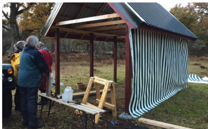
Fabric sides on the shelter to provide protection from the weather.