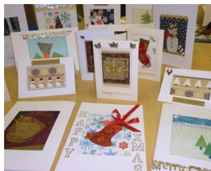
Christmas cards made by students.

Public opinion has been sought on BT's proposal to remove 178 public payphones from across Highland, one of them at Culrain. Initially, Ardgay & District CC did not support the removal of any payphones in the area when we have such poor mobile coverage. However, Culrain's payphone has not been used in the last 12 months, a fact that made A&D CC agree with the removal. ■