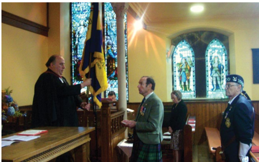
The Royal British Legion Scotland laying up their Old Standard.

and I still need 'God'. The Christian Church still offers a message of 'hope' to the war torn countries of Syria, Afghanistan, Iraq. A message of 'hope' to the starving and the homeless shines out across the world. Of one thing we can be certain, the real present to aching human hearts is that of the love of God in the baby Jesus who was born into this world to set us free. At the end of the old year, and the gateway to