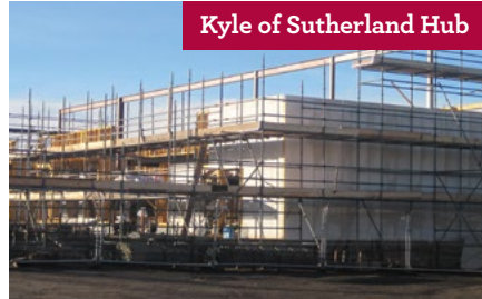
Kyle of Sutherland Hub