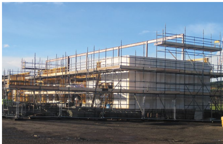
The new building is taking shape.

NEW SPACE FOR CHILDREN, YOUNG PEOPLE & FAMILIES