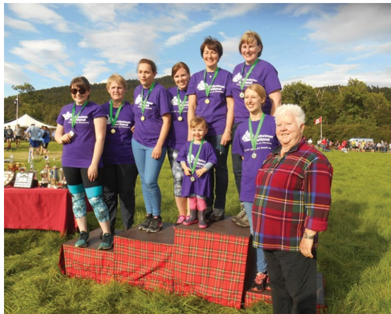
Our Chieftain this year was Val McDermid.