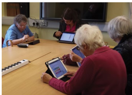
Ipad and tablet class.