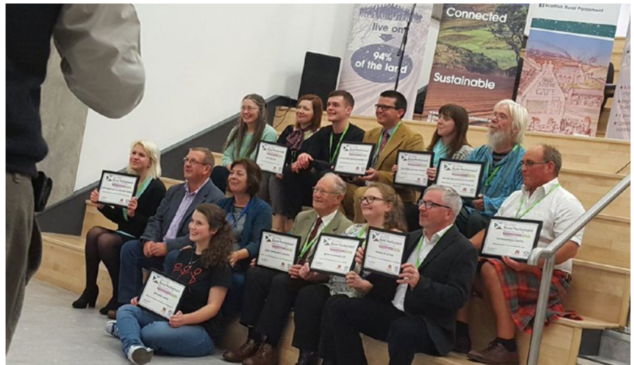
All rural innovators winners 2016.

The site visits were followed by a lunch of locally-sourced produce and the opening ceremony, with a