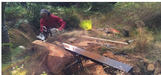
Andy making planks from one of the wind blown trees.

THE COMMUNITY WOOD'S VOLUNTEERS HAVE BEEN BUSY DIGGING THE POND