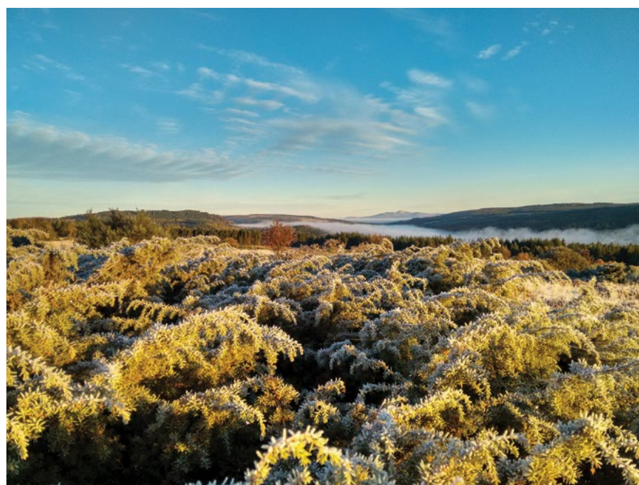
Morning frost

Looking towards Ben Klibreck from Culrain on a frosty morning.