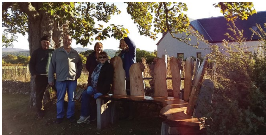
KCEEA members met at memorial bench in October.