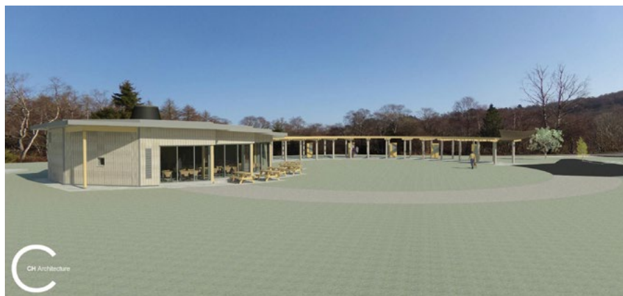
Architectural rendering of the new attraction. /CH ARCHITECTURE