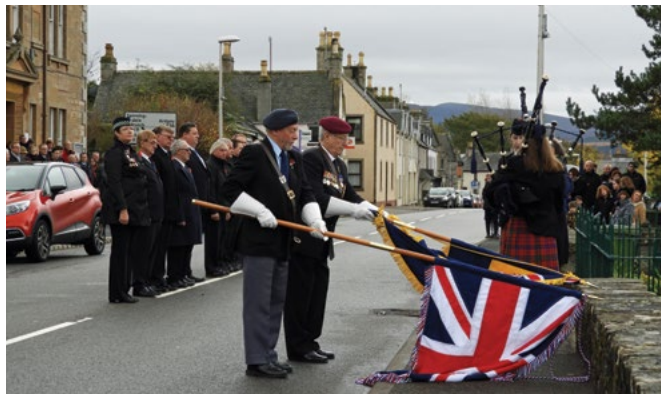
Colours dipped for the lament.