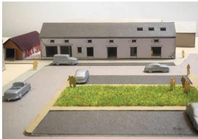
Scale model of the square, Business centre and Art Shed.

The new Business Centre will provide a total of 200 square meters of office space which includes 7 newly furnished offices with a fully equipped kitchen and meeting room. The building is just across the road from the train station, local bus service and has access to free dedicated parking. The Business Centre will contain spaces for the Trust as well as for local businesses such as Business Gateway.