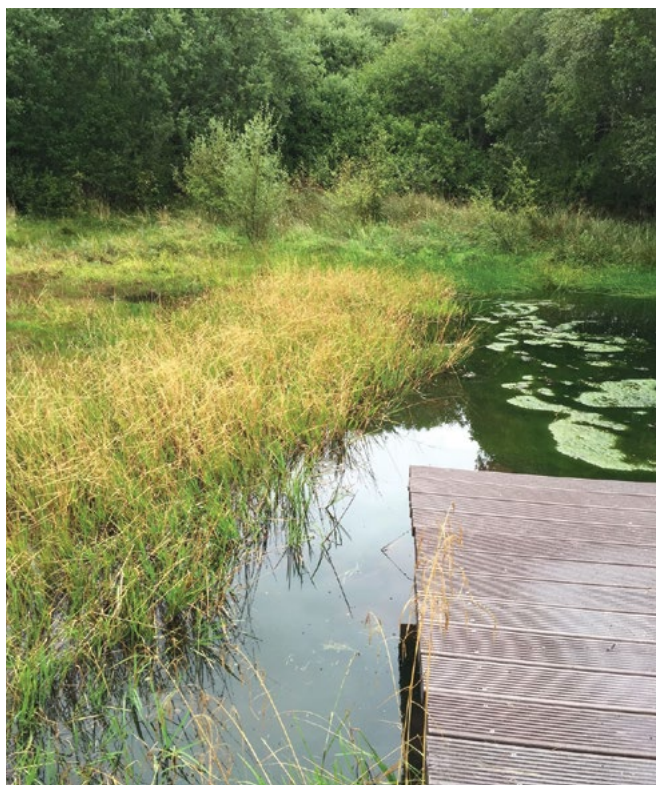
Low water level encourages the growth of vegetation.