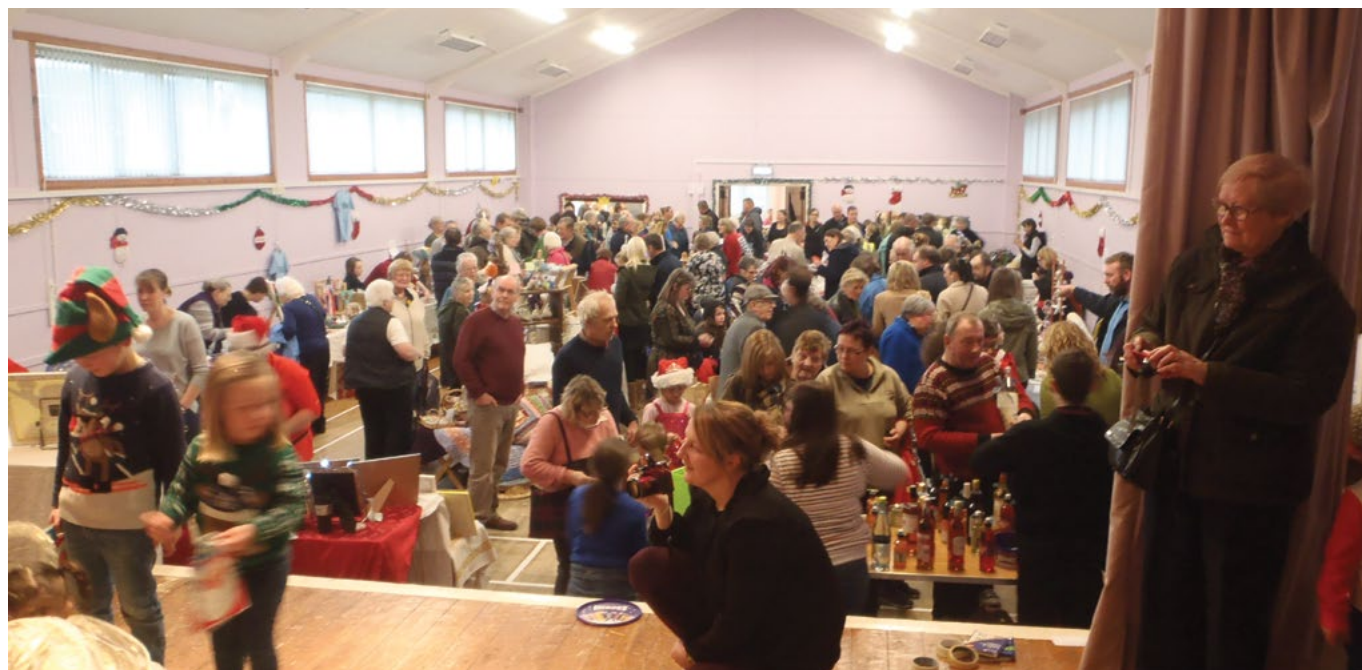
A view of the main hall at our Christmas Fair, on Saturday 26th November.