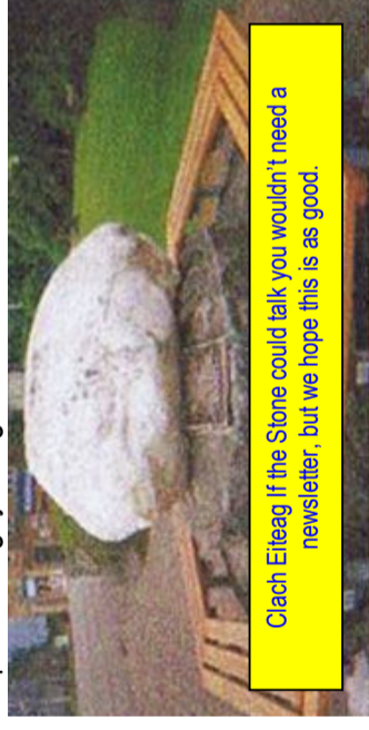
Clach Eileag If the Stone could talk you wouldn't need a newsletter, but we hope this is as good.