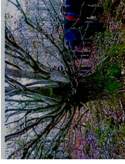
Pollarded Oak in the Gearrhoille woods

ACCESS TO A SHORTER, ALL ABILITIES, SECTION OF PATH IS VIA THE GEARRCHOILLE CAR PARK BESIDE THE A836 (ON THE RIGHT HAND SIDE AS YOU HEAD FOR TAIN, APPROX. 1/2 MILE FROM THE WAR MEMORIAL) IT ALSO HAS AN INFORMATION BOARD.