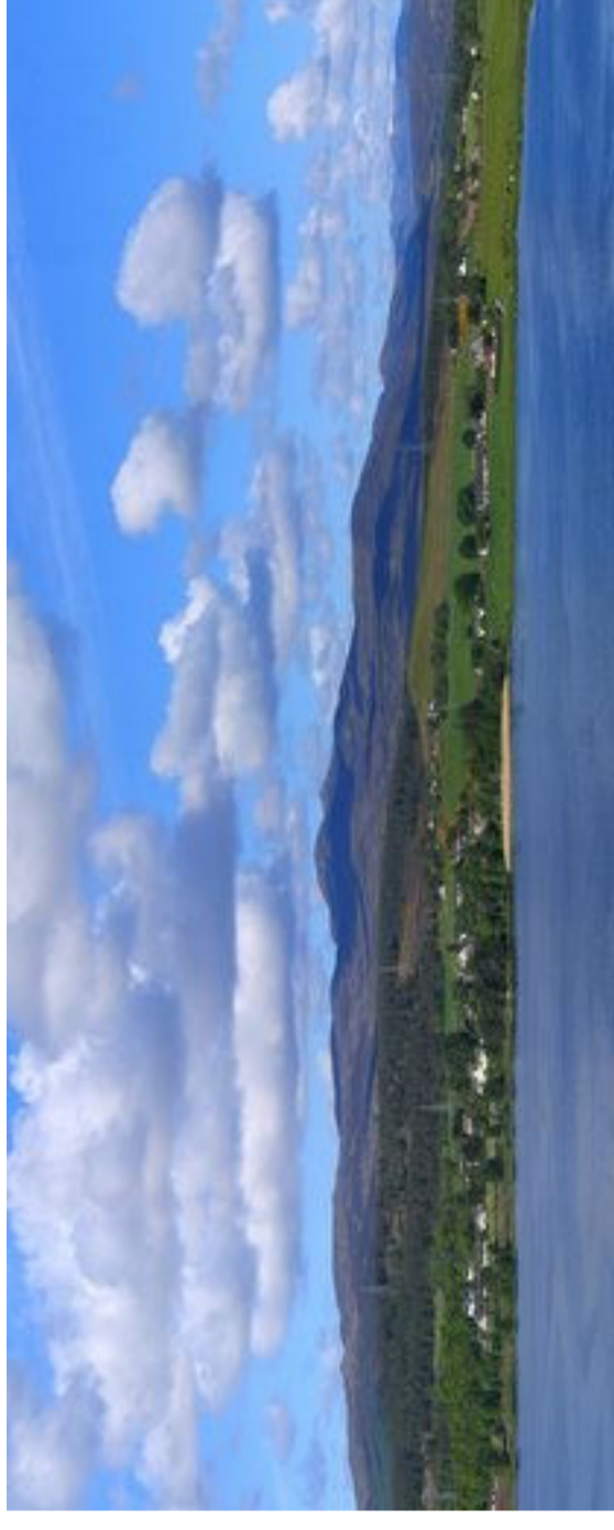
Ardgay, Cam Bhrenn & Ben Sallachaidh from Bonar Bridge

(Covering Ardgay & District, and including items from Kincardine Parish Church, Gearraichille Community Wood etc.)