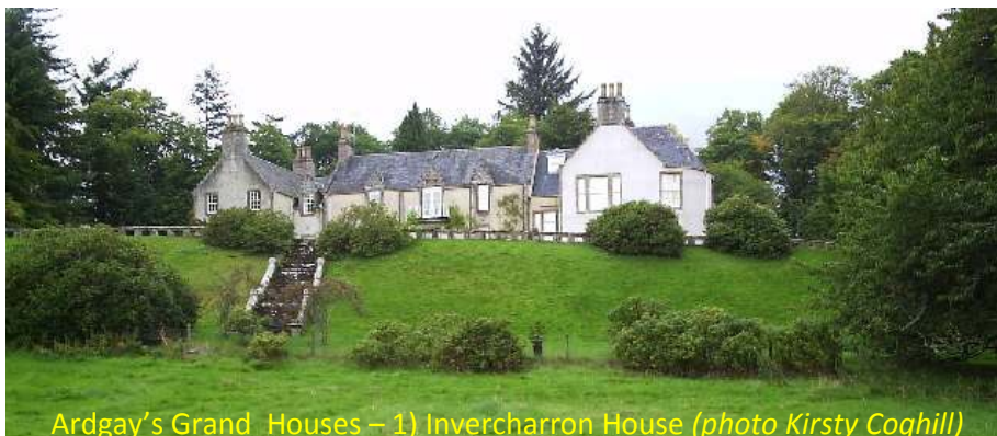
Ardgay's Grand Houses – 1) Invercharron House

If we missed you out and you want to be included in future issues contact any Community Councillor or the Editor – photographs and articles are always welcome.