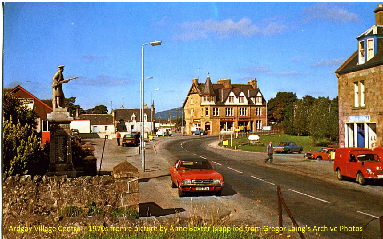
Ardgay Village Centre – 1970s

This Newsletter is also available on-line at: <ardgayanddistrictcommunitycouncil.org.uk>