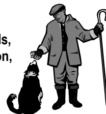
crofting in the

Crofting Resource Programme - The Scottish Crofting Federation is running a programme to help develop crofting in the Highlands & Islands. This could take the form of advice to individuals, training on different aspects of crofting, help for new starters, or looking at development opportunities for individual crofts or for townships. If you want to discuss anything, contact Russell Smith on 01863 766144.