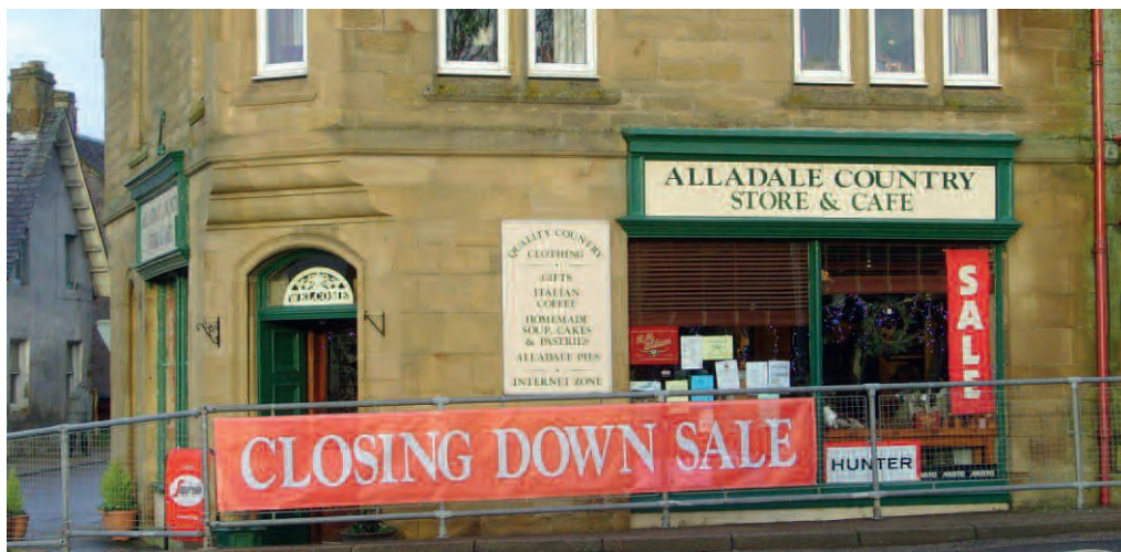
The Alladale Country Store & Café closed for the last time on 31 January 2012

Sadly, Ardgay lost the last and only shop. Although many of us felt that the Alladale Country Store & Café catered more for visitors than provide a local service it does mean a job loss and another empty 'face' for those coming to or passing through our village.