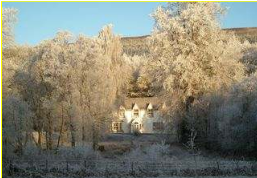
Ardgay's 'Big' Houses - Braelangwell Lodge, Strathcarron

Copy for the Autumn issue should be with the Editor by 17 th August for issue in September.