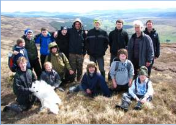
Boys Brigade walk up Meall nan Eun near Whale Cottage at Braelangwell on the May Day holiday. (bet Gemma was first up to the top)