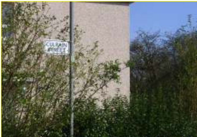
Interesting to find – just around the corner from Ardgay Street in Glasgow – Culrain Street with a pro-rata population to Ardgay Street.