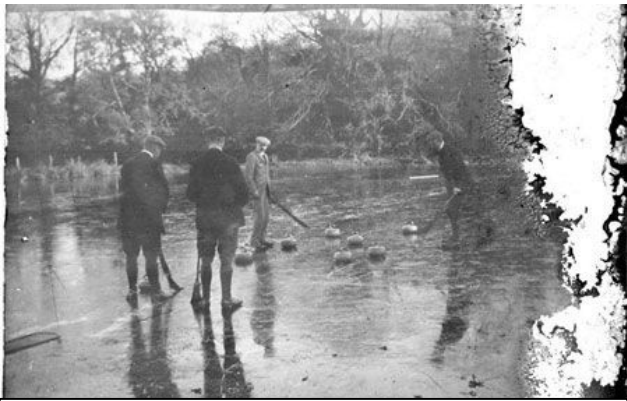
Could this be Ardgay Curling Pond – any of our readers out there remember playing on it?

By the time this newsletter is being read the last page of this year's calendar will have been turned. December is a natural time to pause and reflect on the year just passed. One of the more pleasant tasks for the GCWA directors in the early months of the year was choosing the winning entries from the photo competition. As you will know from the very first edition of this newsletter, those photos now make up the Community Wood's 2010 calendar. [It is worth noting that the generous sponsorship received from three local businessmen has resulted in the 2010 calendar selling for £3.50 – this is £1 cheaper than could be achieved for 2009 by the GCWA alone.] The spring edition of the Community Council newsletter helped spread the word that the Kyle of Sutherland Gala Week committee were to host an Egg Hunt in the